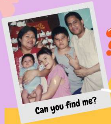
Can you find me?