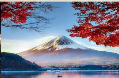
Mt. Fuji, Japan