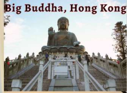
Big Buddha, Hong Kong